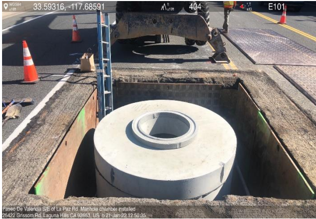
Newly Built Manway Access Point