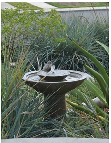
Outdoor Art, Statuary Fountains

Partner With Nature! Installing rain barrels or creating a swale in your garden stores rainwater for your native plants to use. Consider incorporating these elements of sustainability into your new garden.