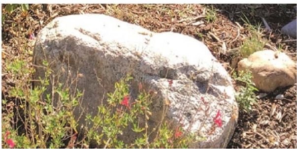
Landscape boulder in natural shades of tan, gray, taupe