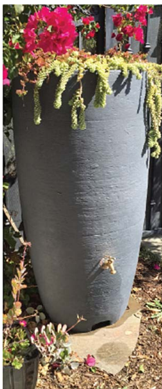
Decorative Rain Barrel

Partner With Nature! Installing rain barrels or creating a swale in your garden stores rainwater for your native plants to use. Consider incorporating these elements of sustainability into your new garden.