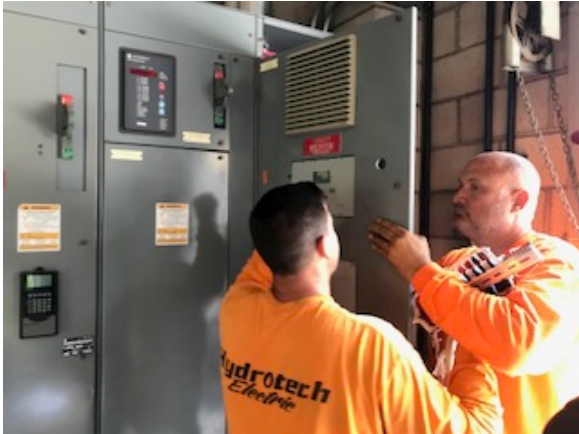
Crews Installing ATS Power Monitor at Southwing L.S.