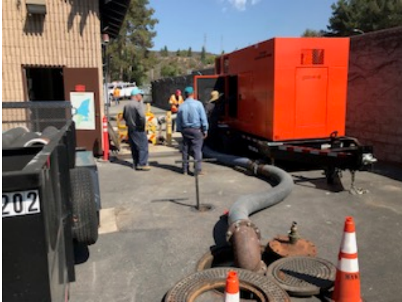
Temporary Bypass Operation at Aliso Creek L.S.