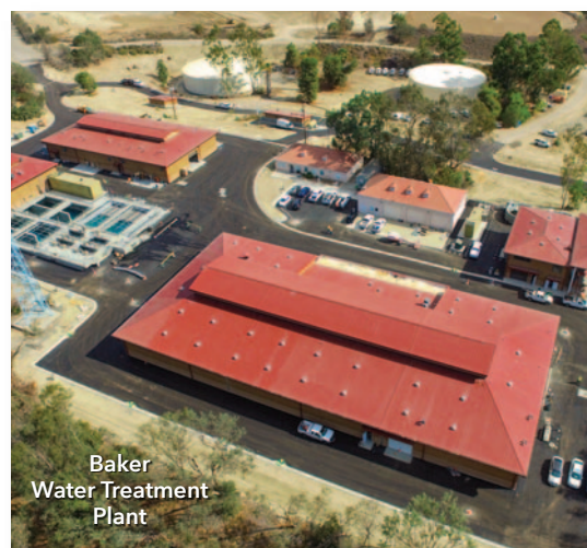
Baker Water Treatment Plant

http://water.epa.gov/lawsregs/sdwa/ucmr/ucmr3/basicinformation.cfm .