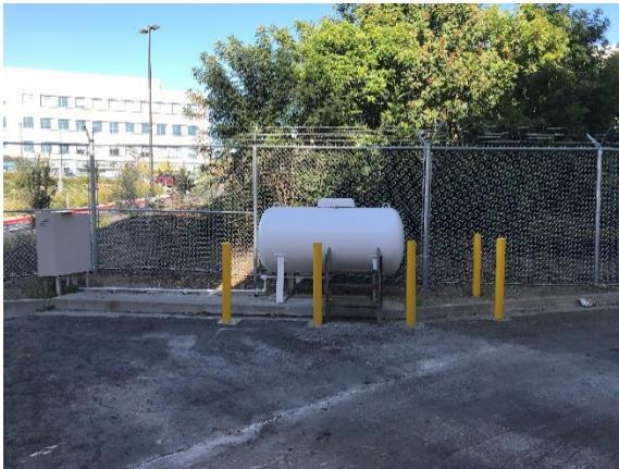
Existing Fuel Storage to be Replaced

Submittals are complete. Procurement of materials is underway. Work anticipated to begin in early October.