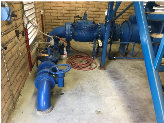
Existing Piping to be Replaced