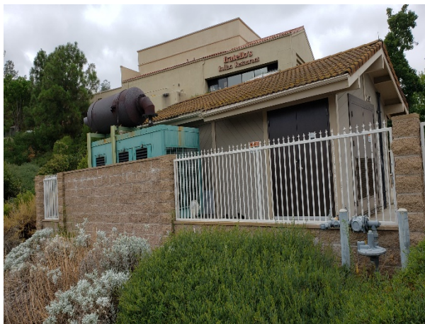
Current Conditions at Upper Salada Lift Station

Currently in submittal phase. Construction anticipated to begin in December.