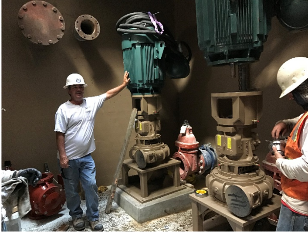
Newly Installed Pump and Motor