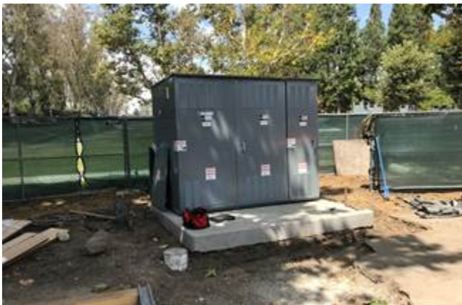
Newly Installed Electrical Switchgear