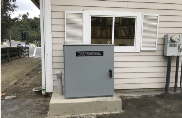
New Rectifier at Bridlewood Flow Control Facility