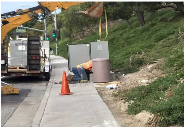
Installation of New Air Vac on Oso Parkway