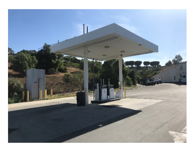
Existing Fueling Station