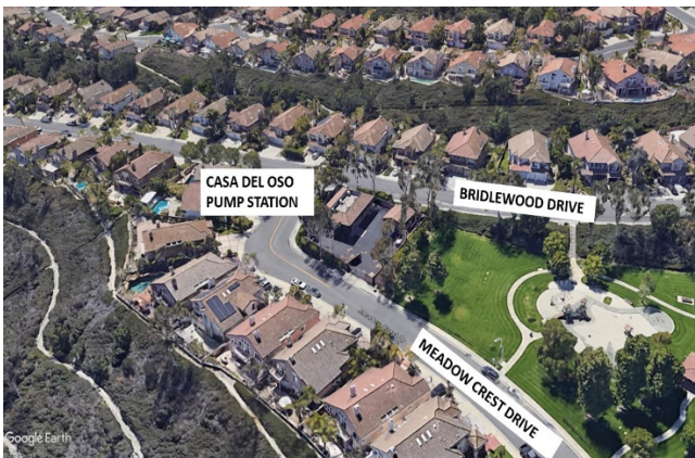
Casa Del Oso Pump Station Site Overview