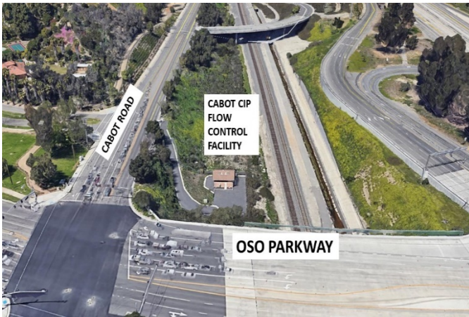
Cabot CIP Flow Control Valve Upgrade

Construction documents were prepared by Lee & Ro, Inc.