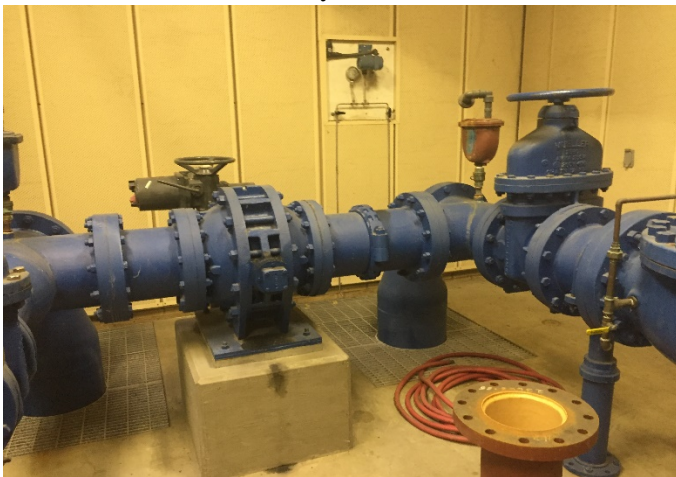
Existing Valves and Piping to be Replaced