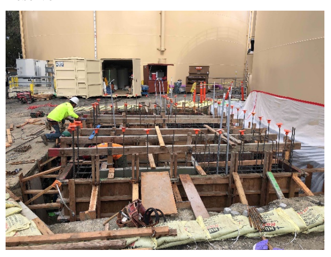
Building Foundation Prep at Crown Valley Reservoir