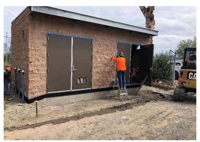
Building Construction Continues at Marguerite Reservoir