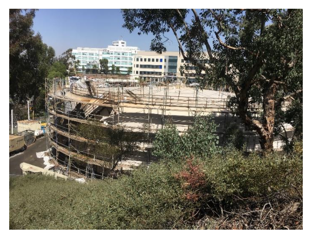
Preparation for Exterior Coating