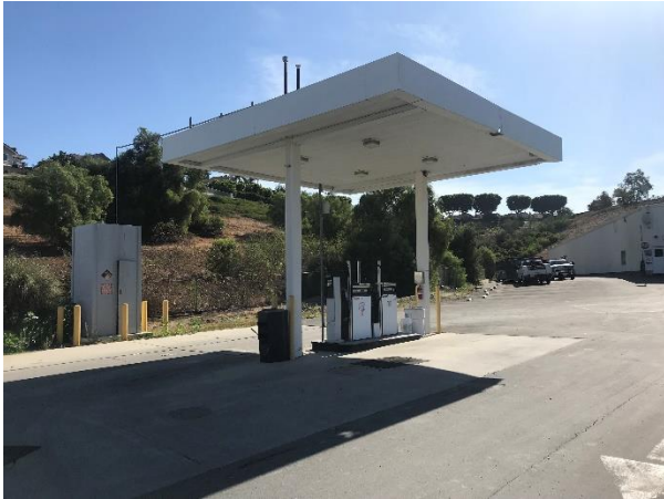
Existing Fueling Station