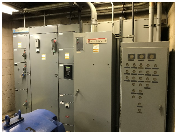
Existing Electrical Equipment to be Replaced at Pacific Island Drive No. 3 Pump Station