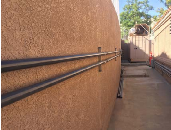
Highlands Pump Station Conduit Installation