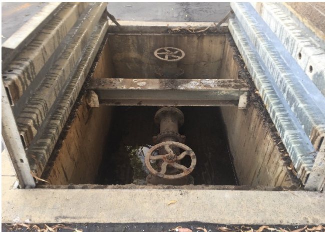
Existing Valve Vault to be Replaced