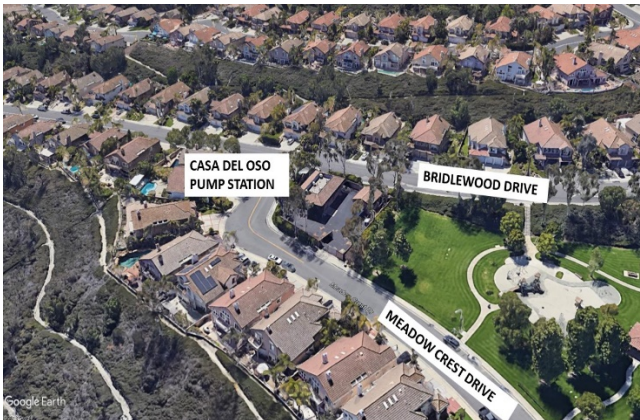
Casa Del Oso Pump Station Site Overview