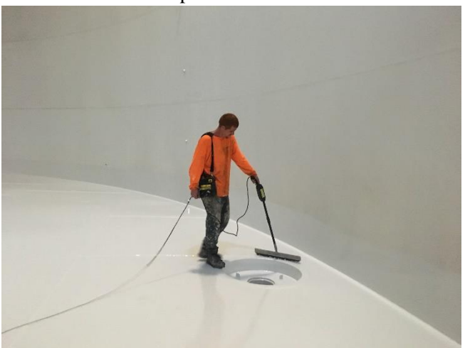
Interior Coating Spark Test Being Performed