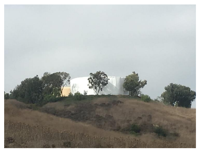
Bear Brand Reservoir Exterior Containment Prior to Coating