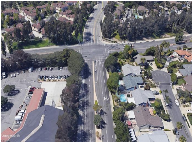
Project Location Overview at Alicia and Niguel Road