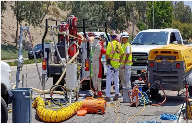
Crew Preparing for Vault Entry