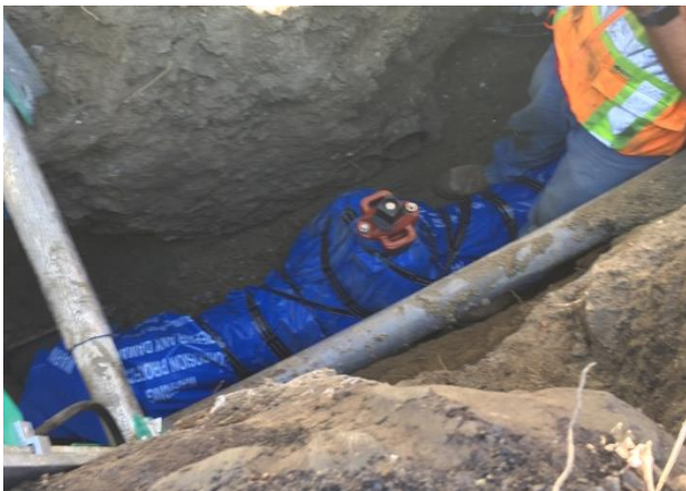
Installation of New Valve on Oso Parkway