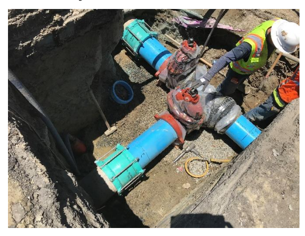
New Valves at Marina Hills and Golden Lantern in Laguna Niguel