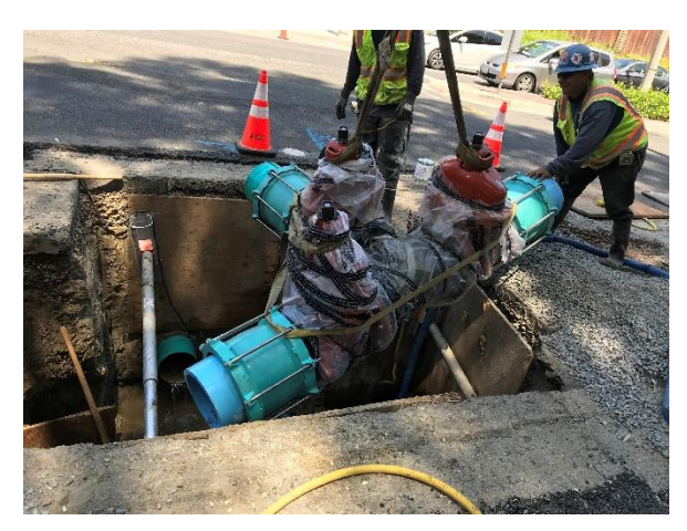
Installation of New Valves and Tee at Spadra and La Paz in Mission Viejo