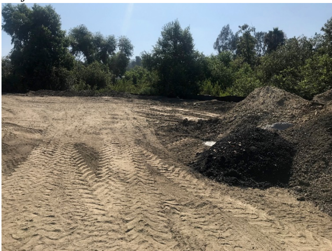
Approximate Location of Launch Pit

Project is in the submittal phase. Construction anticipated to begin in August.