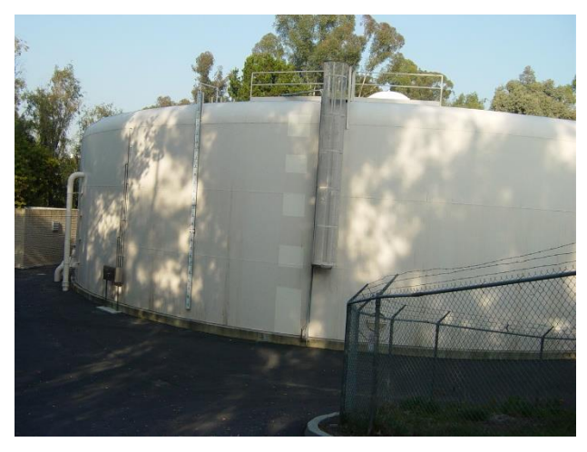
Saddleback Reservoir to be Recoated