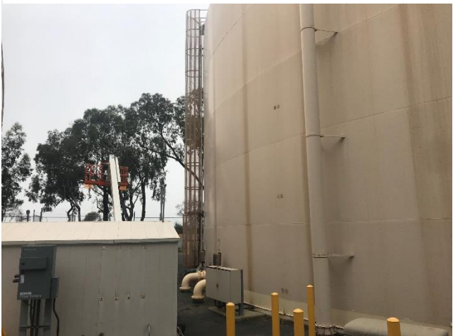
Existing Ladder to be Replaced by New Spiral Staircase