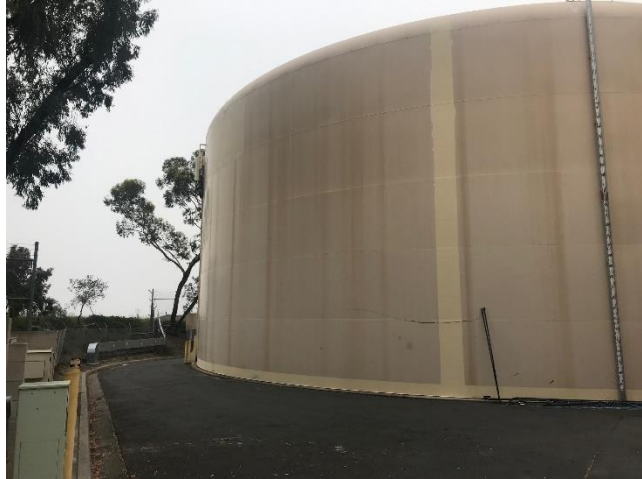
Bear Brand Reservoir to be Recoated