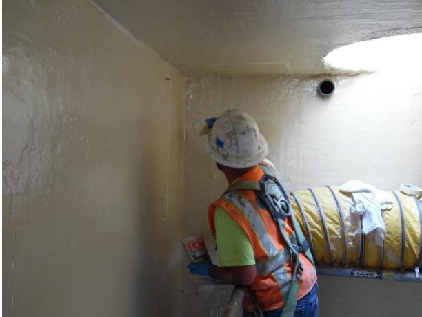
Newly Coated Wet Well