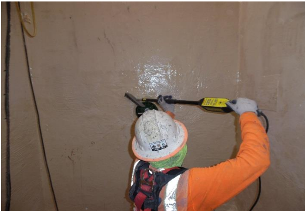
Crews Performing Spark Test in Wet Well