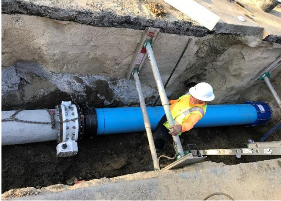
Installation of Mainline and Valve at Old Ranch Rd.