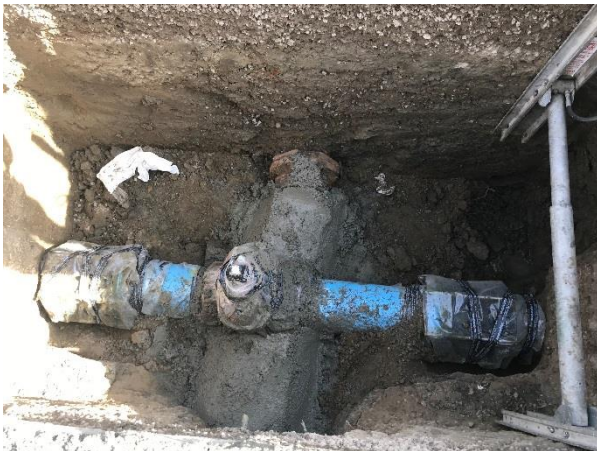
New Piping and Valve on Niguel Rd.