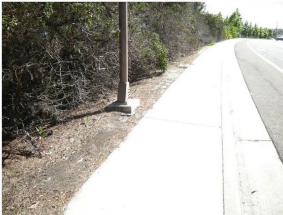
Existing Air Vent to be Replaced