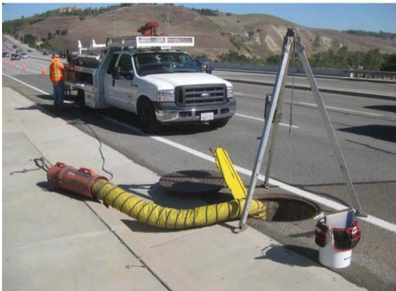
Typical Required Manway Entry