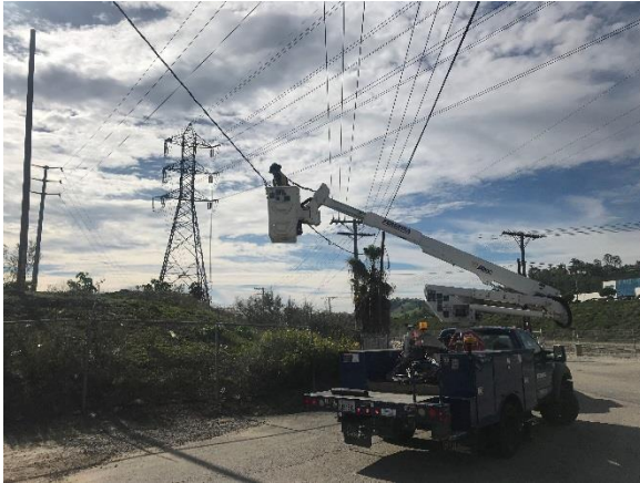
Relocation of Existing Power Lines and Poles