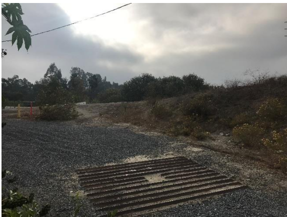
Existing Camino Capistrano Yard Conditions