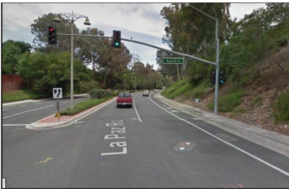
Existing Tee and Valves on La Paz Road to be Replaced