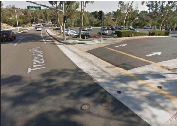
Existing Tee and Valves on Trabuco Road to be Replaced