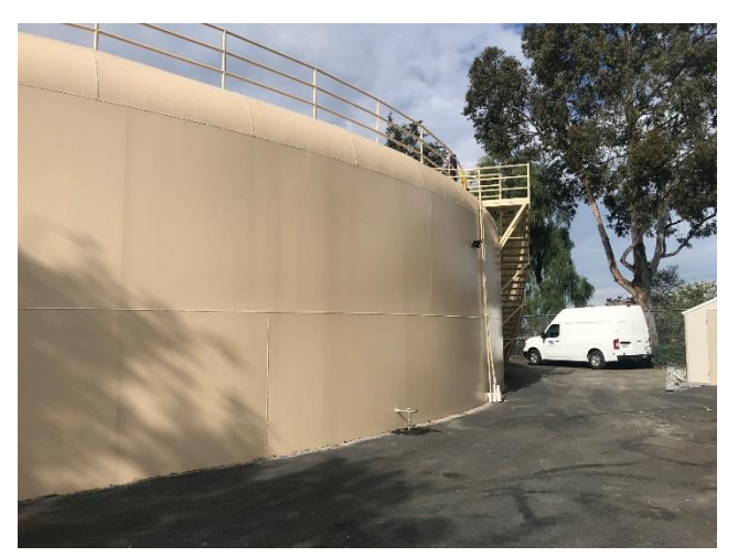
Completed Exterior Coating