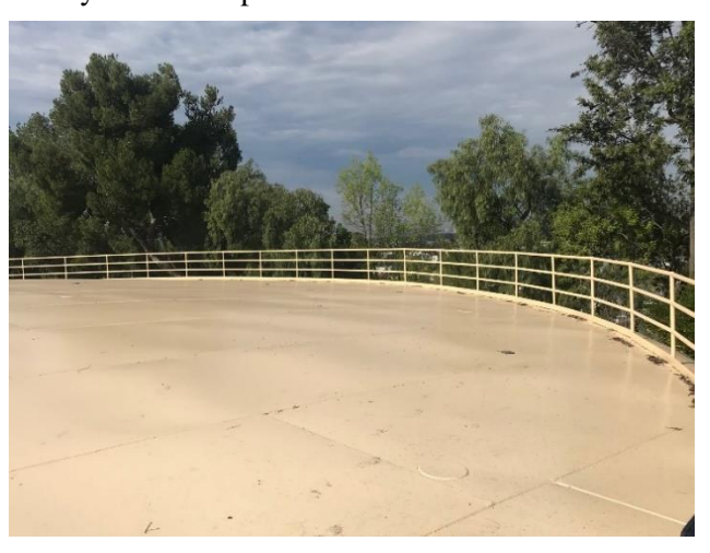
New Perimeter Roof Guard Railing