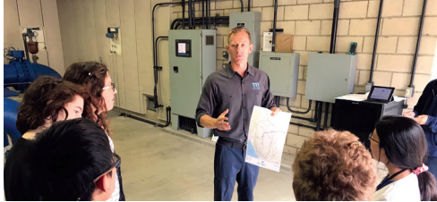
A homeschool co-op class at Capistrano Valley Christian School learned about water conservation and water operations as they toured a local pump station to understand how water is delivered to their homes.