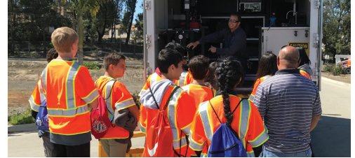
Local middle school students learned about the wide range of exciting career opportunities in the water industry as they visited with District Staff at our Operations Center.