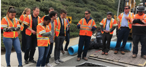
A group of young professionals in the Coro Fellowship Program learned what it takes to replace a valve and why doing so is important to the District's infrastructure improvement and water reliability program.

Over the last few months, several different community groups visited us to learn about topics ranging from water supply, conservation, infrastructure, careers and much more. At Moulton Niguel, we appreciate the opportunity to meet with our customers and interested community members to showcase how we provide high-quality water on a day-to-day basis. Students and young professionals of all ages toured District facilities to learn firsthand about how our infrastructure delivers reliable water service, and got to meet the staff who oversee our daily operations. We were pleased to have our Board Members participate in several of the events and lead discussions about our service-minded organization.